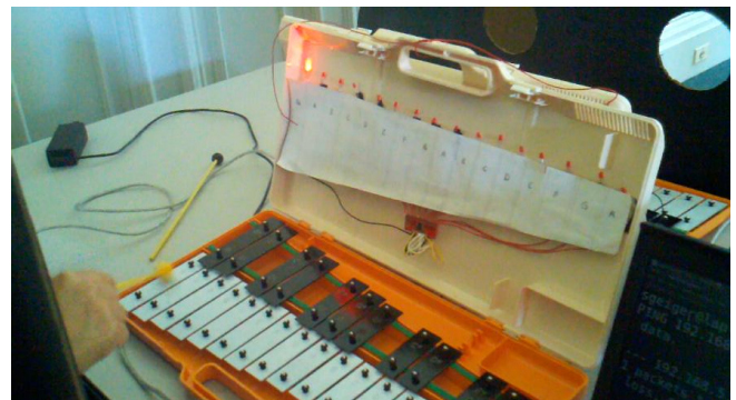
Figure 4. Xylophone lighting up the lower G note on the upper display, mallet striking the corresponding aluminum key