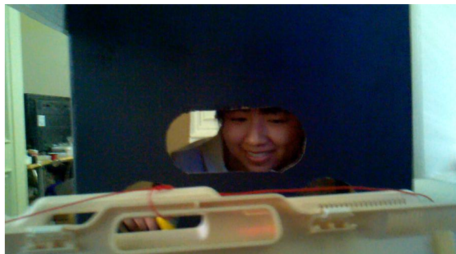
Figure 5. Human operator in the black box